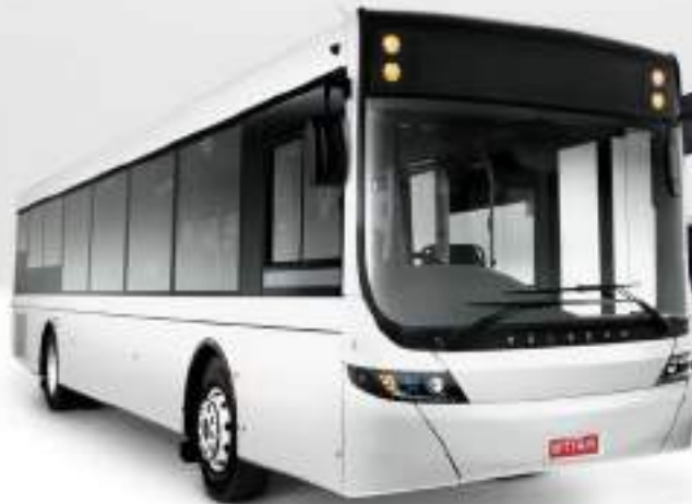
LOW-ENTRY ROUTE BUSES