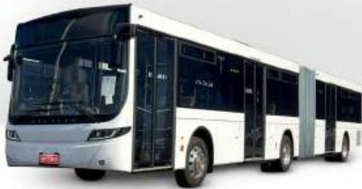
ARTICULATED LOW-ENTRY ROUTE BUSES

No matter which bus – or combination of buses you need – you can always be sure the Optimus we make for you today will be our best bus yet.